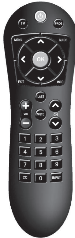
OCE-0189A REV 04 (07/10/17)