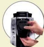
REMOVE K-CUP HOLDER

CAUTION: There are sharp needles that puncture the K-Cup above the K-Cup holder and in the bottom of the K-Cup holder. To avoid risk of injury, do not put your fingers in the K-Cup Chamber.