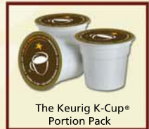
The Keurig K-Cup® Portion Pack

Note: To brew K-Cup® Portion Packs, DO NOT REMOVE the foil lid, or puncture. K-Cup should be placed in brewer with the foil lid on.