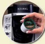
REMOVE USED K-CUP