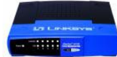
(EFAH05W v2 shown)