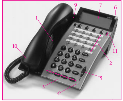
16 Button Display