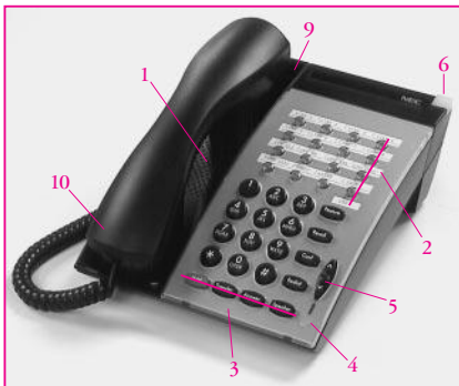
16 Button Non Display