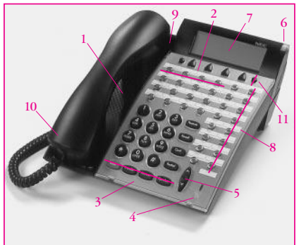
32 Button Display with 16 DSS/BLF One Touch Keys