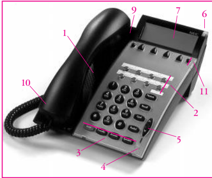
8 Button Display