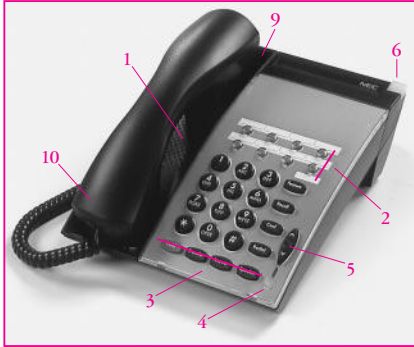
8 Button Non Display