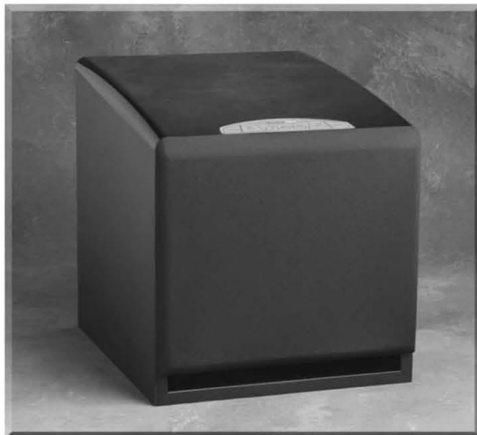
Audio/Video Subwoofer System